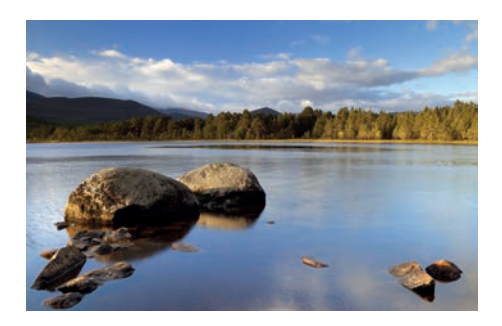
Scotland has some of the most beautiful scenery in the world.

Aberdeen has five shopping centres, a range of sports facilities offering sports from wall climbing to swimming, a choice of four cinemas, a 19th century theatre showing a variety of very famous musicals, ballets and operas,