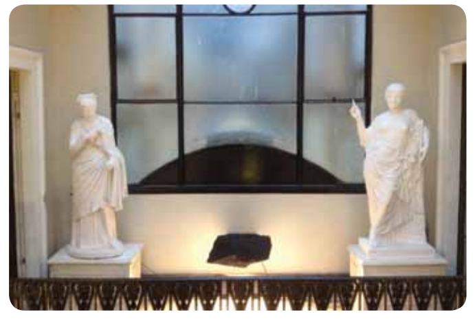
Greek Revival - The statues in place.