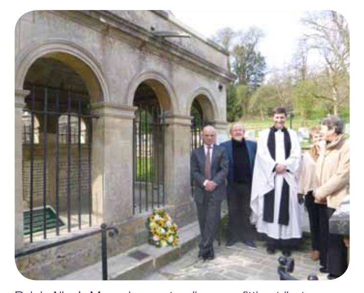
Ralph Allen's Mausoleum, standing as a fitting tribute to his significant contributions to Bath and the English postal system.

The mausoleum needed repair, with railings and iron stone cramps rusting and fracturing the stone. Detailed inspection showed that damage was worse than anticipated, costs crept up and Heritage Lottery Fund assistance was sought. £5,000 from the Enhancement Fund contributed toward an impressive £20,000 pot raised by members of the congregation, which in turn un-locked £47,000 from the HLF. Art historian Nikolaus Pevsner (The Buildings of England series) states that Allen was shown designs of the original structure the day before he died, and we hope that both Allen and Pevsner would approve of this careful restoration. This project again shows the Fund working at its best, by supporting community initiative and helping to un-lock further funds.